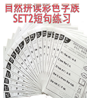
自然拼读第2阶段 sentence练习纸 单词到句子升级